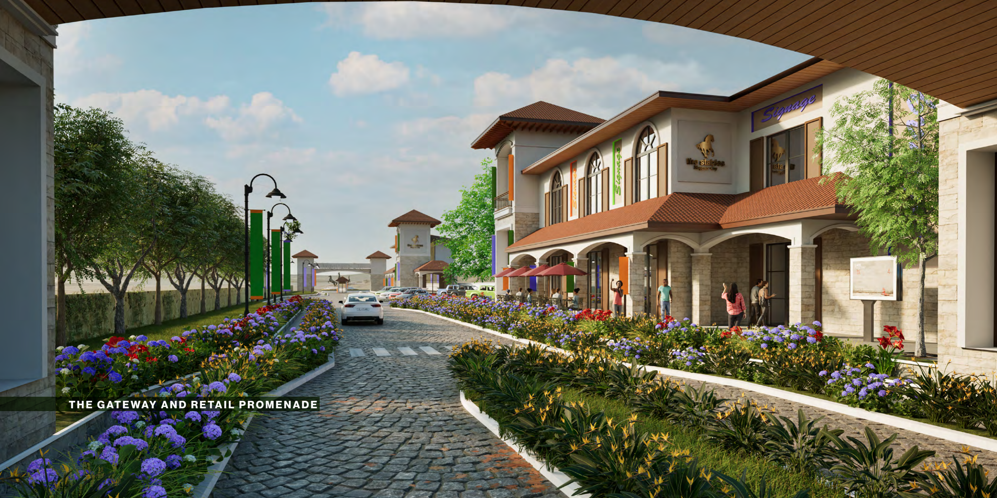
THE GATEWAY AND RETAIL PROMENADE